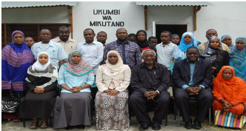
Hon. Lady Justice Rabia Hussein of the Zanzibar High Court (Centre) in a group picture with ZLSC with Some of Government Officials, ZLSC leadership after the Opening Ceremony on marking the Death Penalty day at ZLSC Hall, Migombani, Zanzibar on 10 th October, 2013.