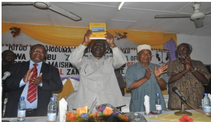
Launching ZYBL: The Second Vice President of Zanzibar, Amb. Seif Ali Iddi Launching ZYBL Vol. I.

For the First time ZLSC managed to launch ZYBL volume 1 of 2011, this event make ZLSC to be the first organization in East Africa and make Zanzibar to be the Second country to publish ZYBL after South Africa.