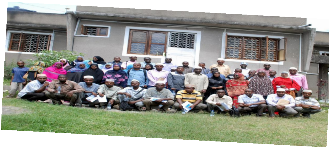
Training Makes Perfect: Secondary School Teachers in a Human Rights Training in Unguja

Therefore, in 2013 the Centre organized two training programmes for Secondary School teachers of Civics Subject in schools in both Unguja and Pemba. This is done with good collaboration between the Centre and Zanzibar Ministry of Education where by the Centre facilitates the training and teachers never miss the trainings. During this trainings it has been found that, this type of training have been very helpful and reaches a lot more people over and above those who attend. The Centre has great dream to change the attitude and method of teachers in teaching civics subjects especially in human rights aspect.