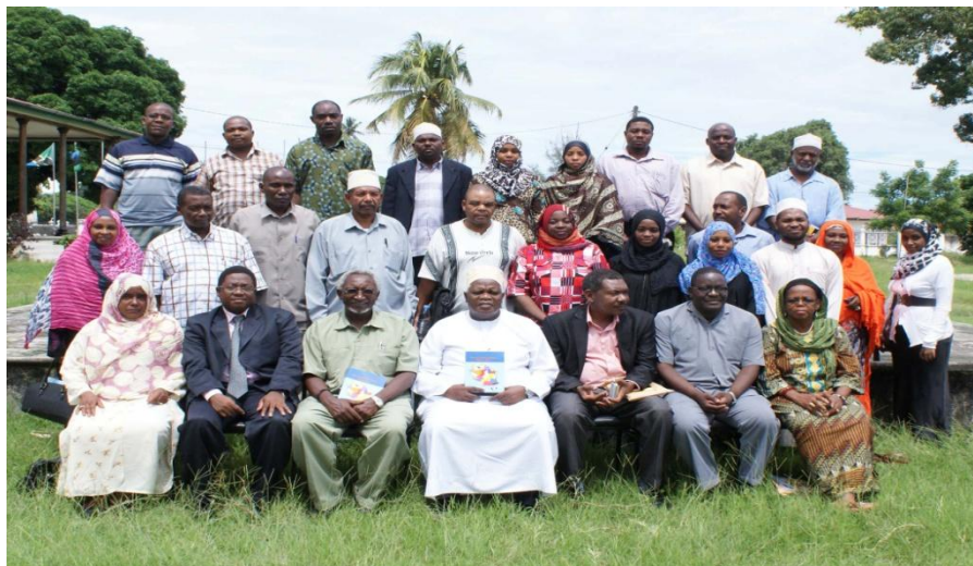
The Speaker of the Zanzibar House of Representatives in a group picture with some of Government Officials and ZLSC staff after launching of Tanzania Human Rights Report 2012 at Ecrotanal Hall, Maisala, Zanzibar on 3 rd May, 2013.

On 3 rd May, 2013, ZLSC launching the Tanzania Human Rights Report at EACROTANAL hall, the Chief Guest of this event was the Speaker of the Zanzibar House of Representatives. The participants were some of Government officials, Paralegals, Citizens and Trade Union Members.