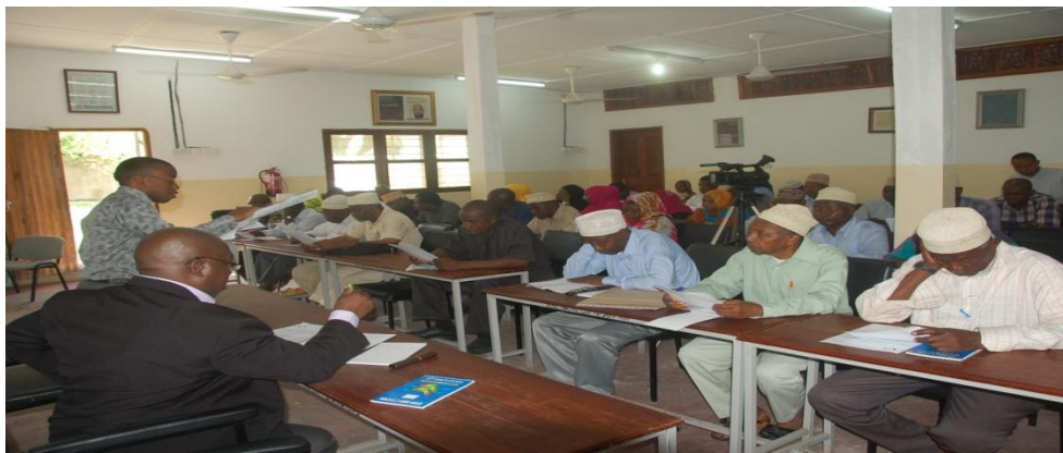
Participants in the Shehas, police and land tribunal clerks listening the presentation from a facilitator on Zanzibar Tenure Act, 1992.