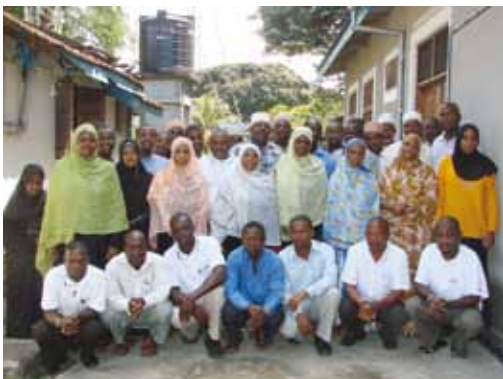
Training ZLSC Paralegals at Umoja wa Walemavu in Zanzibar – March 2009

Paralegals, as indicated earlier in this report, play an important role in the provision of Legal aid and assistance at the grassroots level in the community. Paralegals both in Unguja and Pemba have helped the Centre in giving legal assistance in the community. In 2009, the Centre through the Paralegal desk has received a total