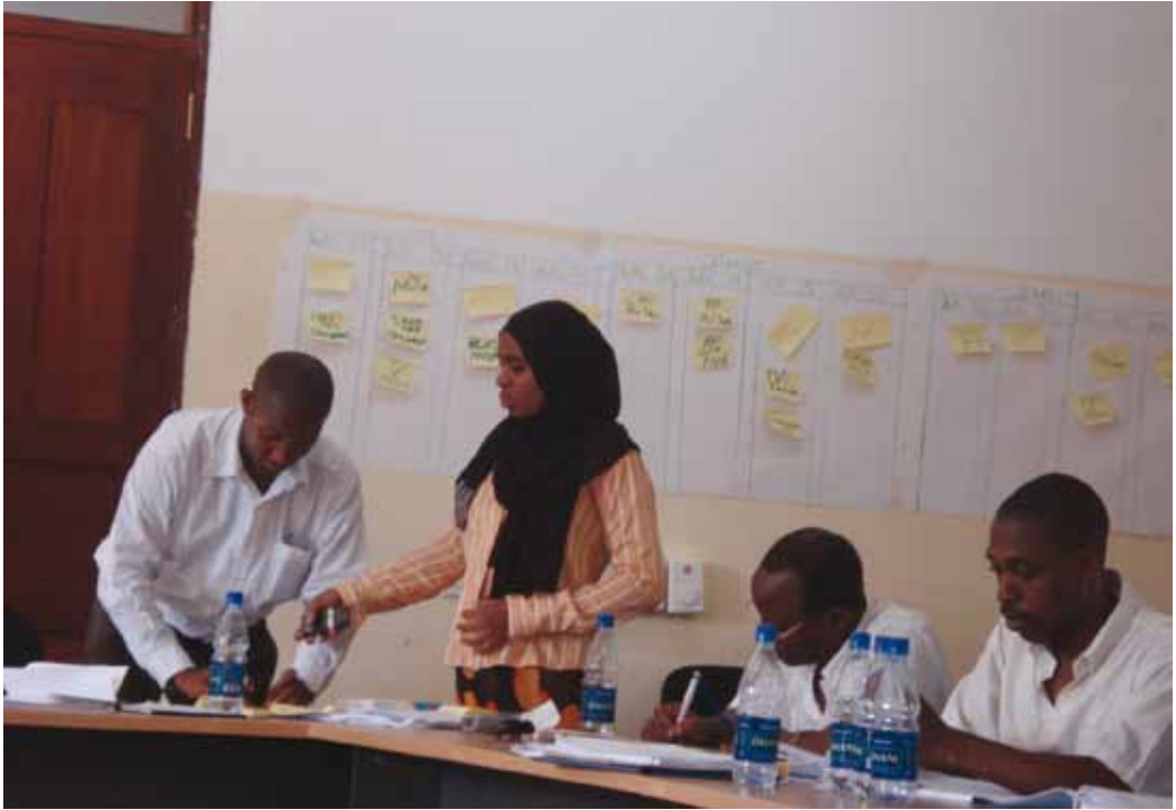
ZLSC Staff and Board Retreat at Umoja wa Walemavu, Unguja, Zanzibar preparing activities for the next year - December, 2009