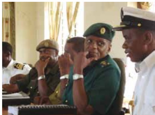
Training the Special Forces of the Zanzibar Government at Gombani Stadium – Pemba – in April 2009