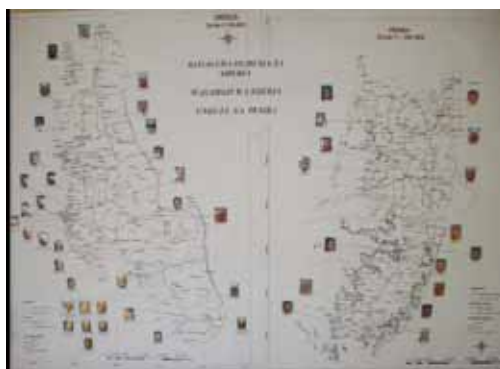
Spreading the wings – ZLSC Paralegals are present in all constituencies in Unguja and Pemba!