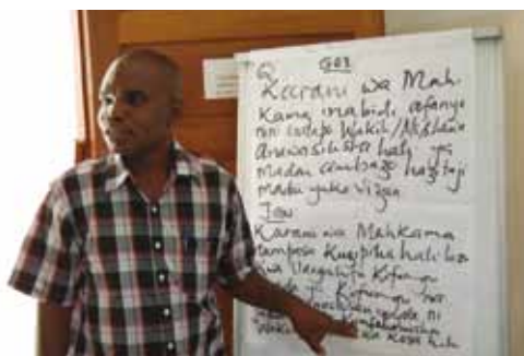
A Court Clerk making a presentation before his colleagues during a training at Elimu Mbadala, Rahaleo, Unguja, Zanzibar - December, 2009.

The very first meeting of the Forum was conducted in Pemba on April 2009 at the sub-office of ZLSC. In attendance were about 20 CSOs from Pemba and Unguja. In that meeting it was unanimously agreed that NGOs policy meetings will be held interchangeably every three months between Unguja and Pemba. Following that resolution, the second Forum meeting was held in Unguja on 20 th June, 2009