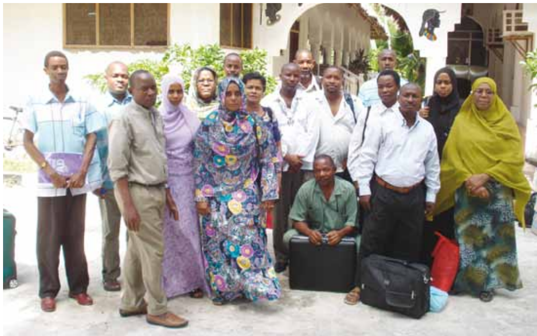
Re-organising - ZLSC Staff and Board Retreat at Jambiani on the East Coast of Unguja – July 2009